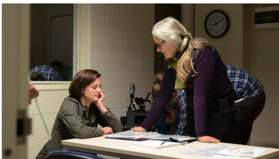
Jane Campion and Elisabeth Moss in From the Bottom of the Lake .

Tweet 2 Recommend 7 Share 0 LinkedIn Share submit Email article Print Reprints & permissions